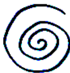
ŠNEČÍ ULITA (KLUBÍČKO)